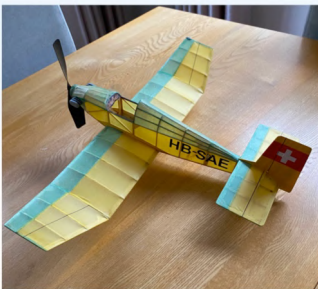
Left: Brian Levers winning Bebe Jodel at the November Bushfield Scale Competition Built from a 50 year old original Veron kit. Model weighs only 26.5 grams.