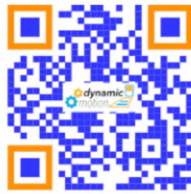
SCAN THE CODE TO SEE VIDEO OF INDOOR FLIGHTS